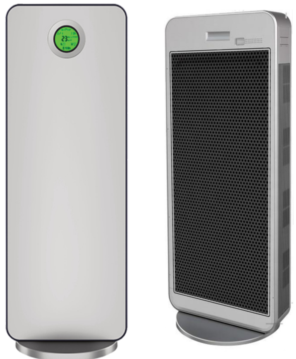
Floor Stand Included