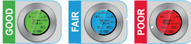
See Air Quality with COLOURVIEW™ Technology