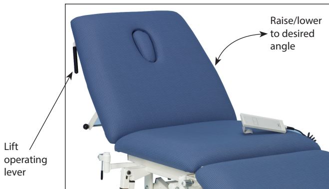
Fig 5: Adjusting the backrest