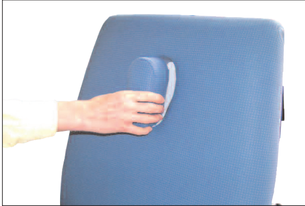
Fig 7: Breathing hole

The Plinth has an integral breathing hole. To use the breathing hole the bung must be removed, as shown in figure 7.