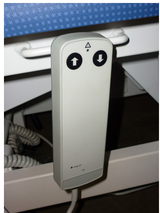
Fig 4: Handset holder

The Plinth has an integral handset holder on both sides of the seat section so that the handset can be stored when not in use (as seen in Fig 4).