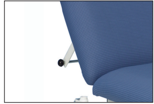
Fig 3: Paper roll holder

5. Situated on the backrest is a paper roll holder (paper roll not supplied with couch). To install a roll, twist anti-clockwise one black ball end fitting off the rod and slide the rod out of its hanger. Position the paper roll between the hanger and reposition the rod and ball end fitting.