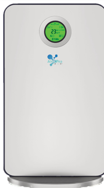
Floor Stand Included