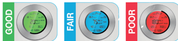
See Air Quality with COLOURVIEW™ Technology