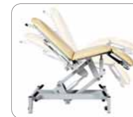
Powered tilting seat

The new Fusion Treatment Chair range has been designed using our extensive knowledge to provide a trusted, ergonomic design providing comfort for the patient, ease of access via the split leg design and comfortable patient positioning for the clinician.