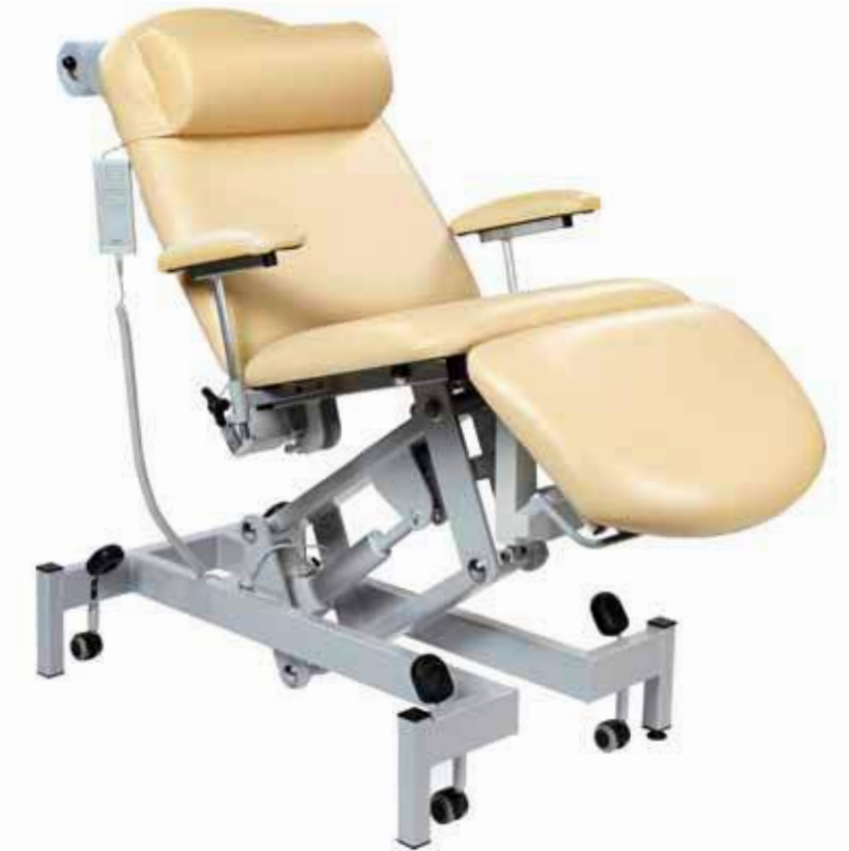
Code: Sun-FTRTE3 Fusion Treatment Chair - Electric Height Single Foot Section Powered head section and powered tilting seat