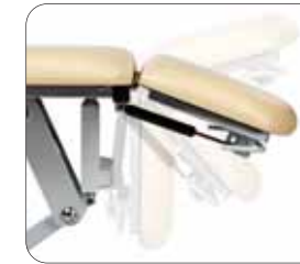
Adjustable foot section