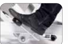
Hydraulic height adjustment