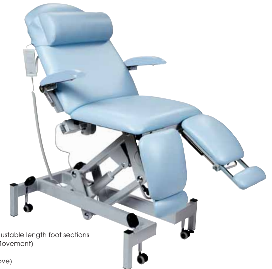
Code: Sun-FPODE1 Fusion Podiatry Chair Electric Height Adjustment Gas assisted head and split adjustable length foot sections (Powered Trendelenburg -20° Movement)

The new Fusion Podiatry Chair range has been designed using our extensive knowledge to provide a trusted, ergonomic design providing comfort for the patient, ease of access via the split leg design, Trendelenburg movement as standard on electric models and comfortable patient positioning for the clinician.