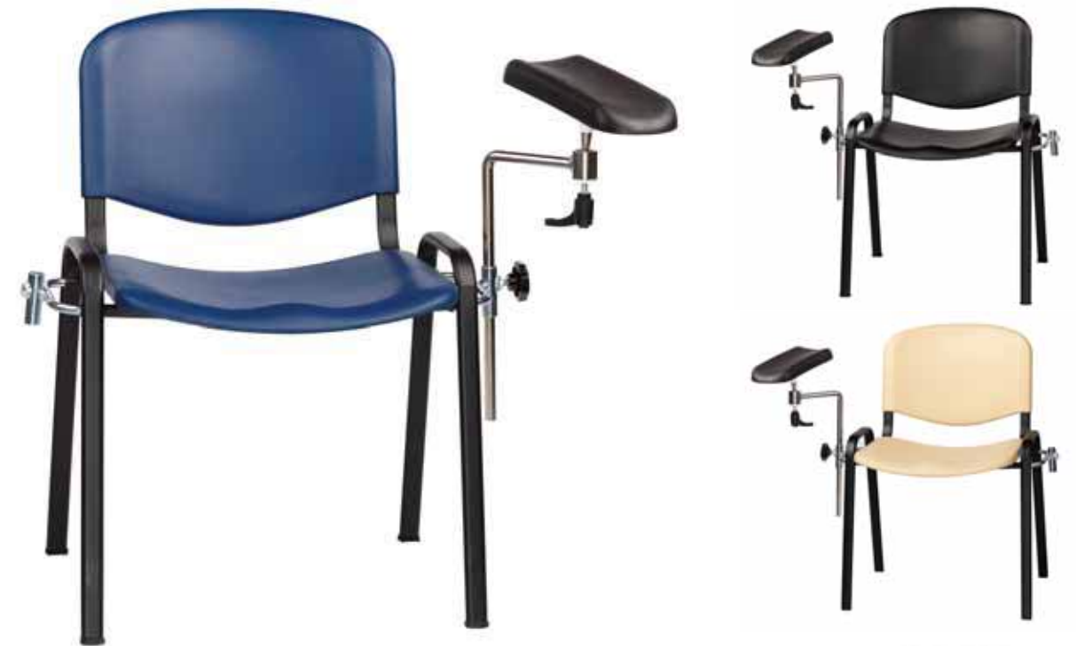
Code: Sun-PCHA Phlebotomy chair Moulded seat and back, one arm rest

Durable, stable and ergonomically designed, phlebotomy chairs are easy to use and adjust and can be used left, right or dual sided with an additional arm, whilst also being easy to clean.