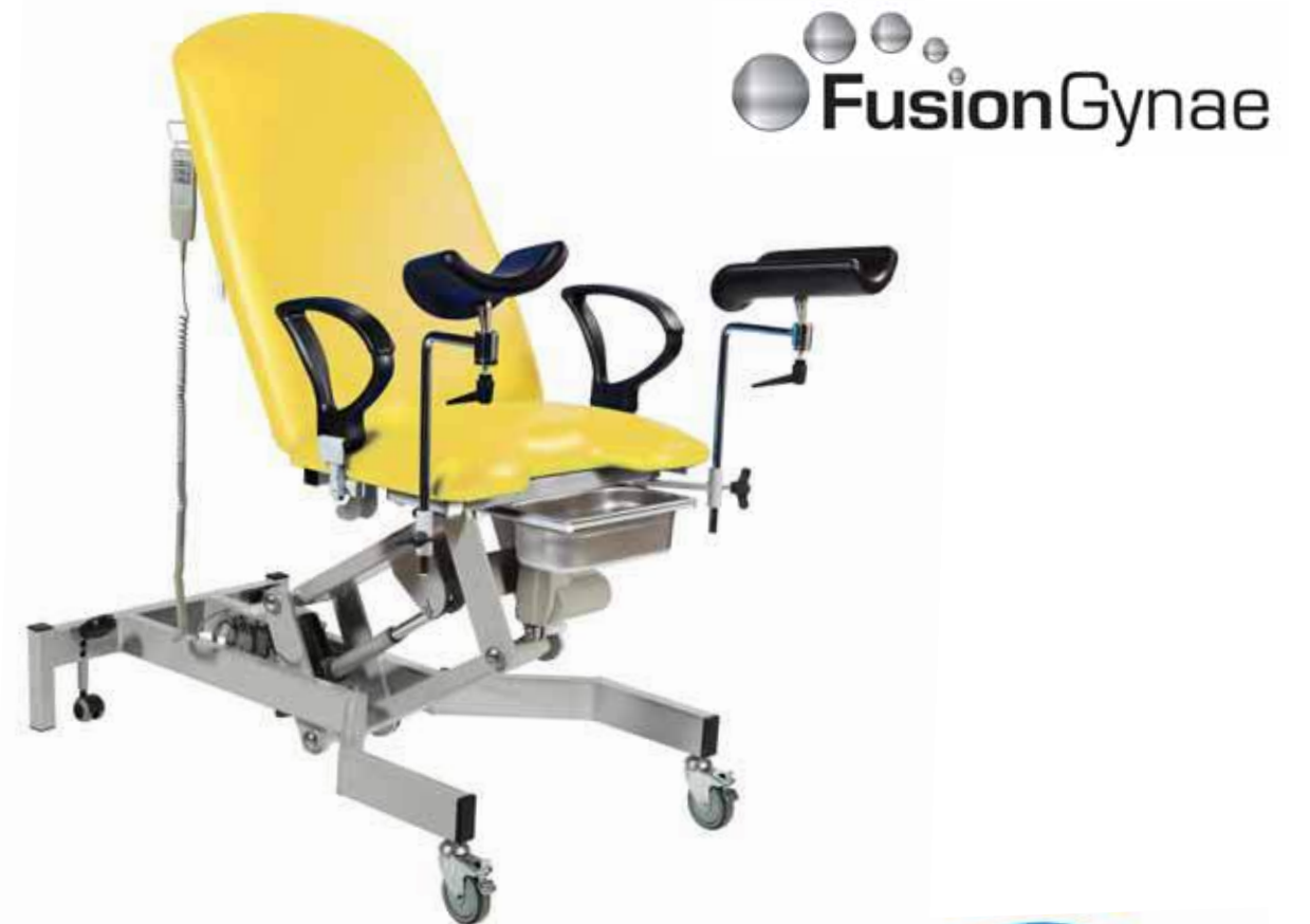
Code: Sun-FGYNE1 Fusion Gynae1 - 2 section couch Electric powered height, gas assisted back, no seat tilt with arm supports & leg supports

The new Gynae couch range features an ergonomic design providing comfort for the patient and ease of access and patient positioning for the clinician. Fusion Gynae is simply, strong, stable, aesthetically pleasing and easy to clean.