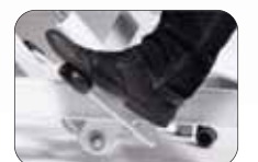
Hydraulic height adjustment