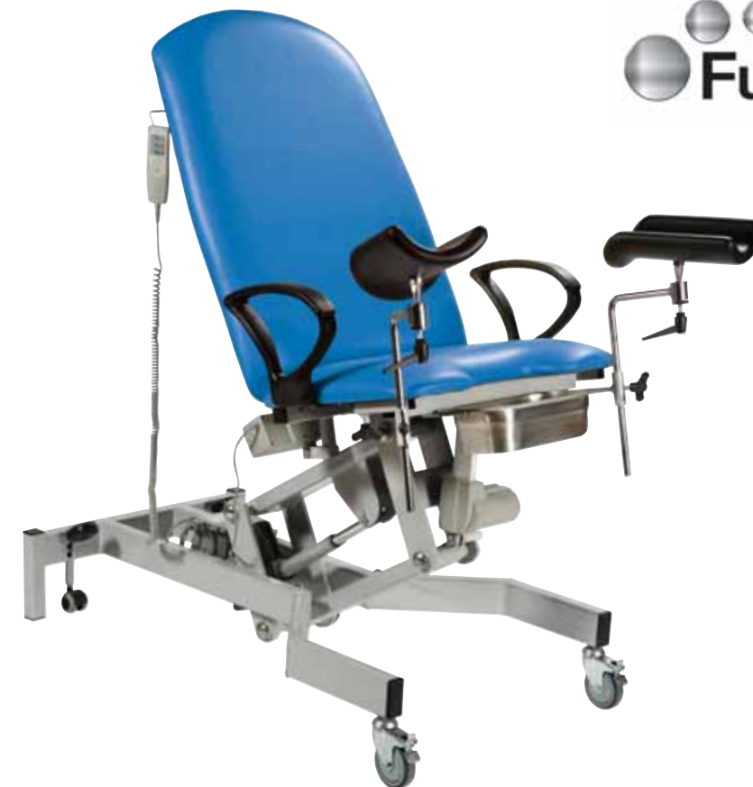
Code: Sun-FGYNE2 Fusion Gynae2 - 2 section couch Electric powered height, gas assisted back, powered tilting seat with arm supports & leg supports