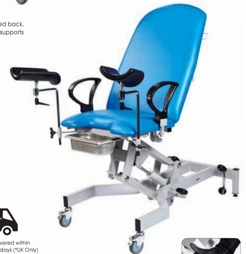
Code: Sun-FGYNH1 Fusion Gynae1 - 2 section couch Hydraulic powered height, gas assisted back, no seat tilt with arm supports & leg supports

Normally delivered within 7-10 working days (*UK Only)